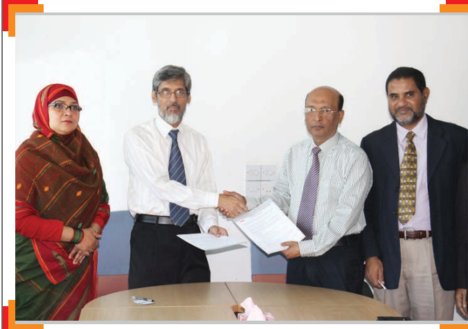
MoU Signing Ceremony between UIU & BSHRM

Bangladesh Society for Human Resources Management (BSHRM) is a Society of HR professionals registered under Society Act of Bangladesh engaged in providing academic, training, development, consultancy, research, evaluation & monitoring services, arranging national and international conferences, seminar, symposium, workshop etc. in the field of human resource and people management of different sectors.