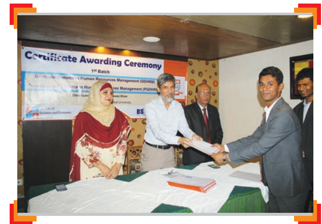
1st Batch Certificate Awarding Ceremony